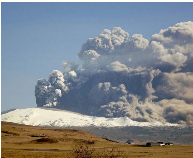
Volcano plume on 17 April 2010

The eruption beneath Iceland's Eyjafjallajökull glacier began on 20 March and created an ash cloud that forced the unprecedented act of closing airspace across northern Europe – planes were unable to fly over much of Europe for six days.